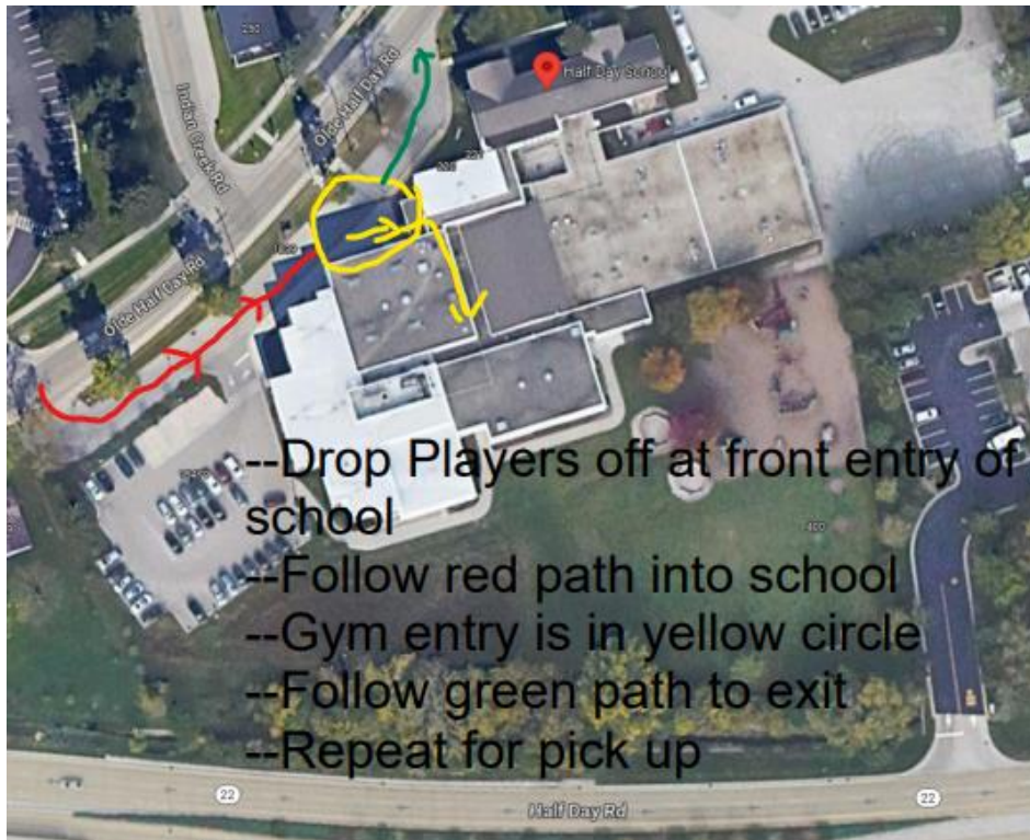
HALF DAY SCHOOL